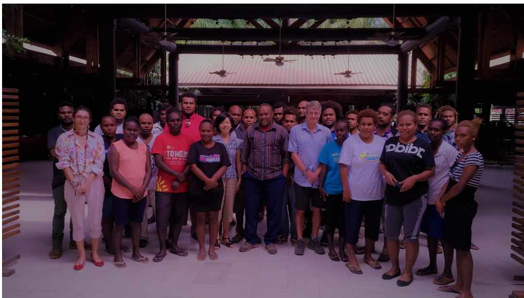
2017 Media and Election training participants at Mendana Hotel, Honiara